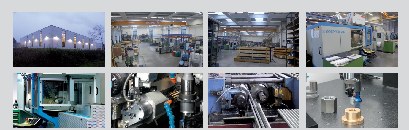
Made in Germany - the factory near Hamburg